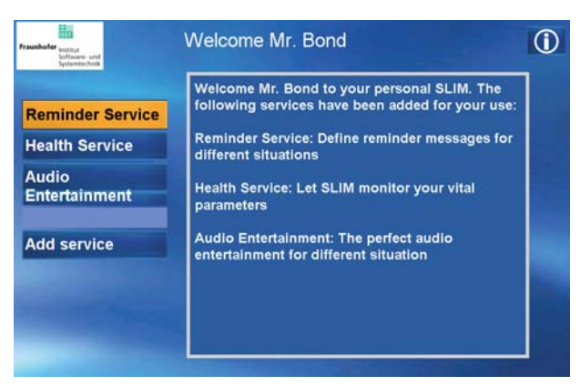
Fig 1: Available AAL services in the SLIM

The initial set of context adaptive services for Mr. Bond includes a reminder service, a health service and an audio entertainment service. The services are available in Mr. Bond's Smart Living Manager (SLIM), which he can access using a mobile or stationary device, e.g. his television.